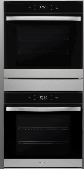
Available in Double Oven WOD52ES4M Z/B/W 5.8 Cu. Ft.

Tackle to-do lists with smart features built for multitasking.